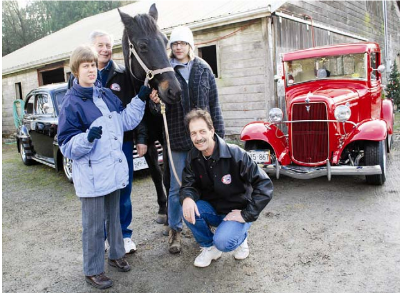
Photo and story provided courtesy of Roxanne Hooper of the Langley Advance