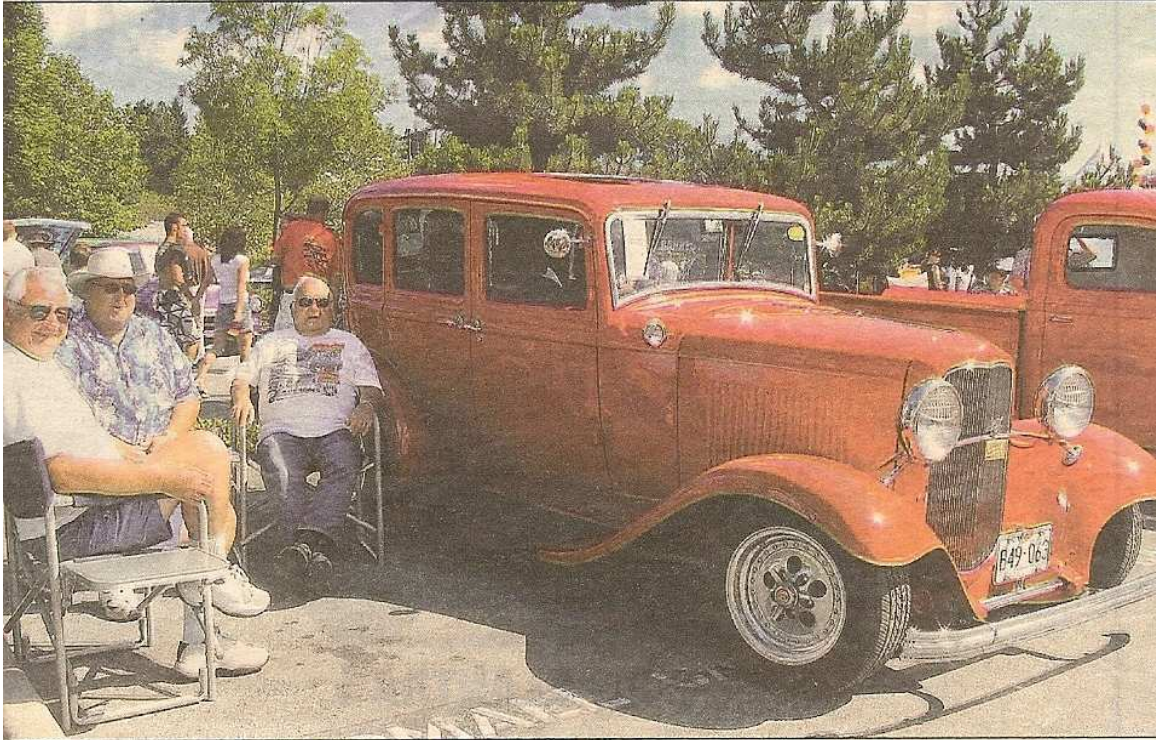
Beside the Ford sedan sit three of the many B.C. Hot Rod Association members displaying their cool rides at last weekend's Boulevard 500 Show in Coquitlam.